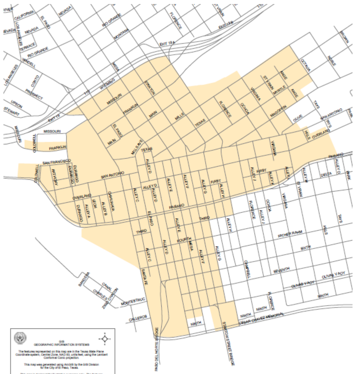
EXHIBIT A - Program Area