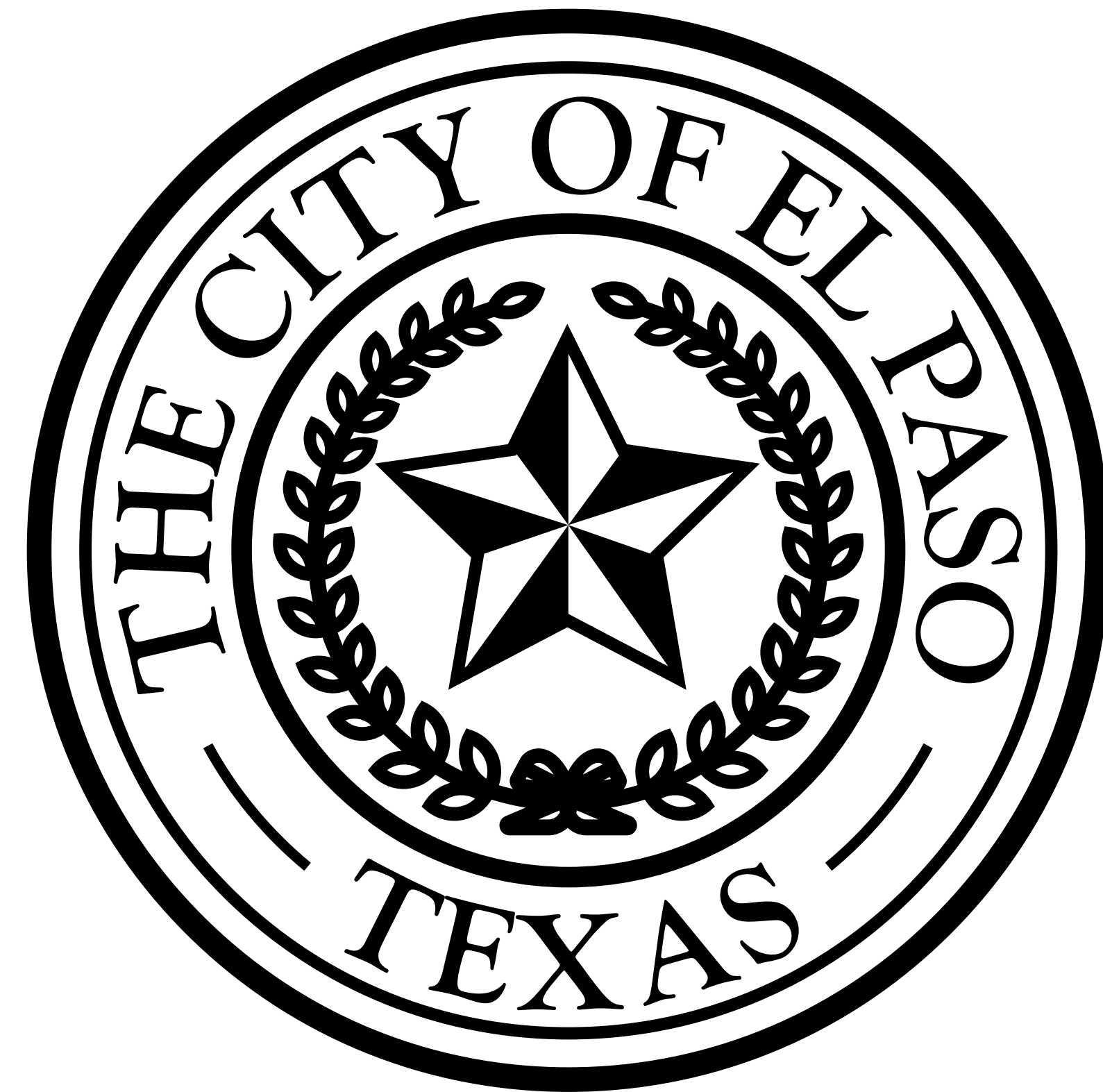
Official City Seal

If the reproduction of the seal is less than 1.0 inch in diameter, do not use the seal.