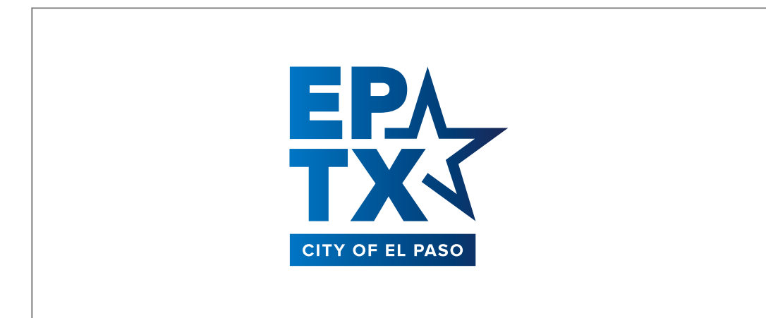
Do not use gradients