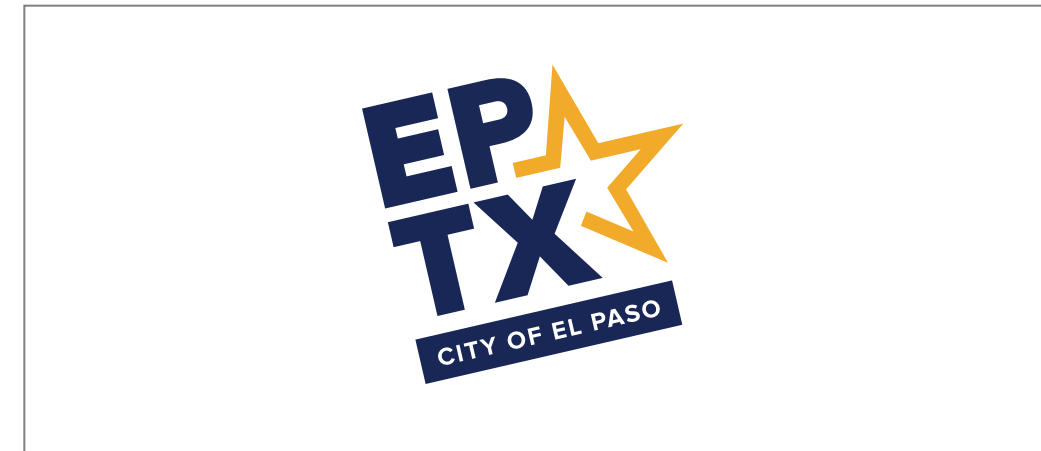
Do not rotate

When using the City of El Paso wordmark, the following rules should be adhered to at all times. DO NOT use the City of El Paso wordmark the following ways: