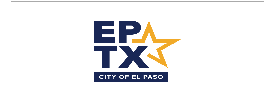
Do not stretch