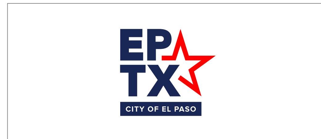
Do not change colors