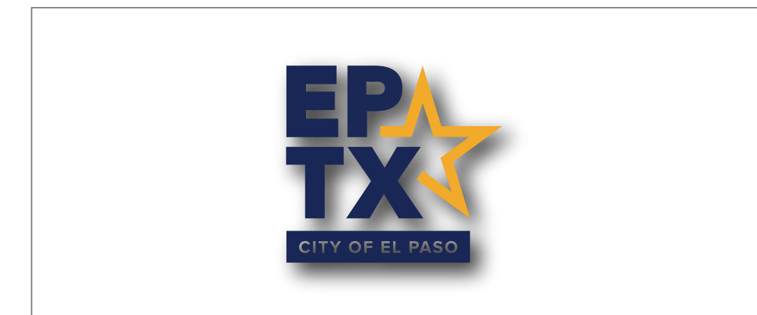
Do not use drop shadows or bevel