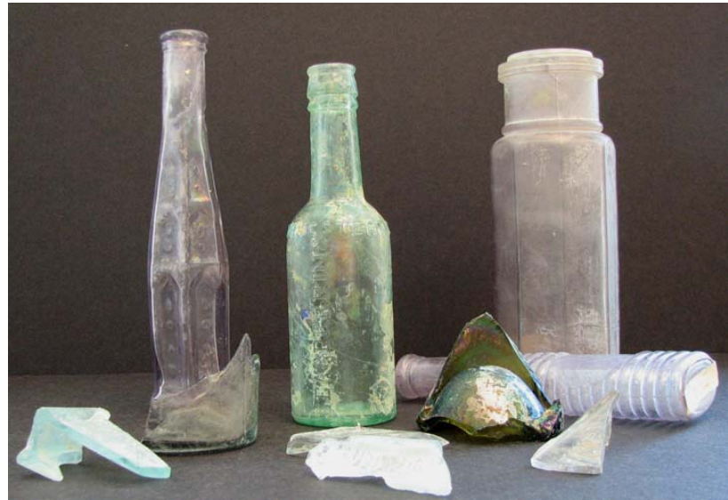
Bottle photo History Exhibition