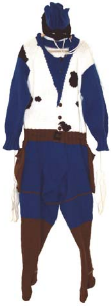
Newport – Unknitting Rubin Exhibition