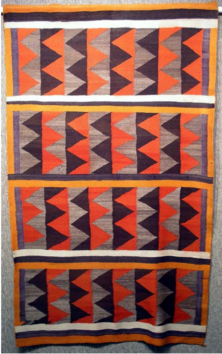
Navajo Rug Archaeology Exhibit