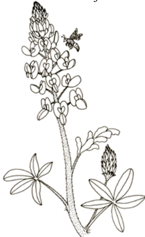
Texas State Flower: BLUEBONNET