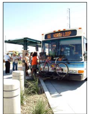
Improved Service — The transfer center features canopies and windscreens at bus stops and air conditioning inside the terminal.