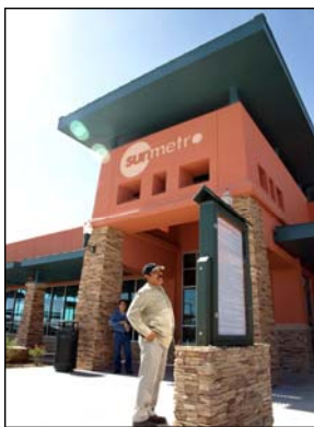
Now Open — The $8.1 million Bert Williams Downtown Transfer Center is now open at the corner of Santa Fe and Third streets.

This state-of-the-art terminal, located at the corner of Santa Fe and Third streets, officially opened on Sept. 27. In addition to providing improved service and amenities for current riders,