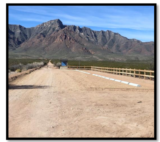
Round House Trailhead

Construction ongoing for Phase I of monumental project – includes competition quality natatorium with diving well, multi-generational community center, and neighborhood water park.