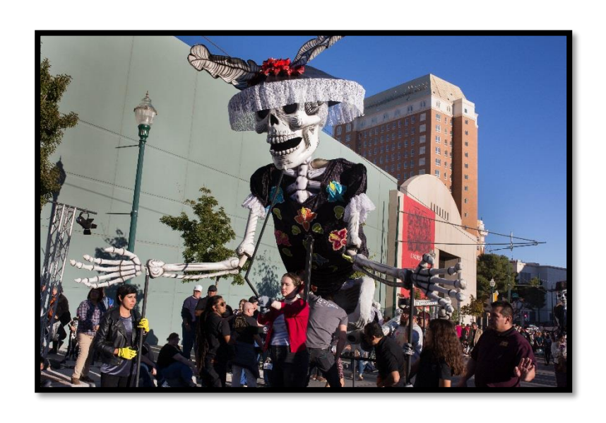
Dia de los Muertos Celebration

Cross-functional Dia de los Muertos Procession and Celebration drew in over 10,000 people to the Downtown Arts District.