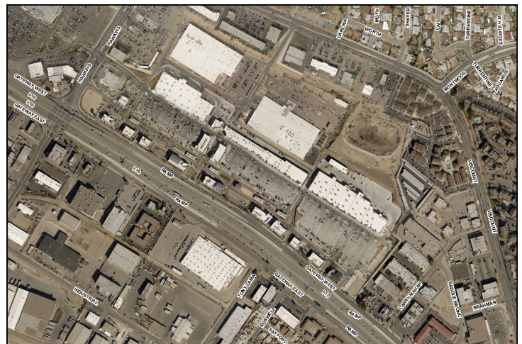
The Fountains at Farah - This abandoned manufacturing facility converted to walkable, outdoor mall is an example of greyfield redevelopment.