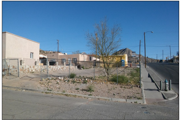
Vacant corner residential lot