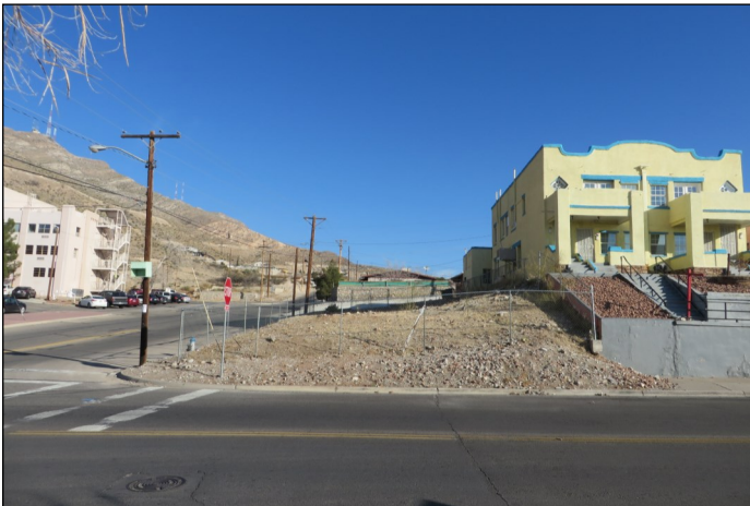
Vacant residential lot in traditional neighborhood