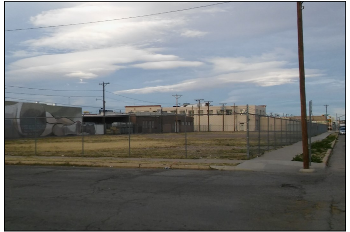
Vacant corner lot suitable for a variety of uses