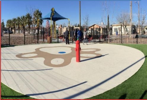
Pavo Real Spray Parks