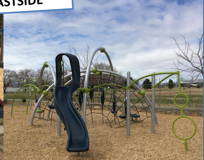
17 Playgrounds Citywide