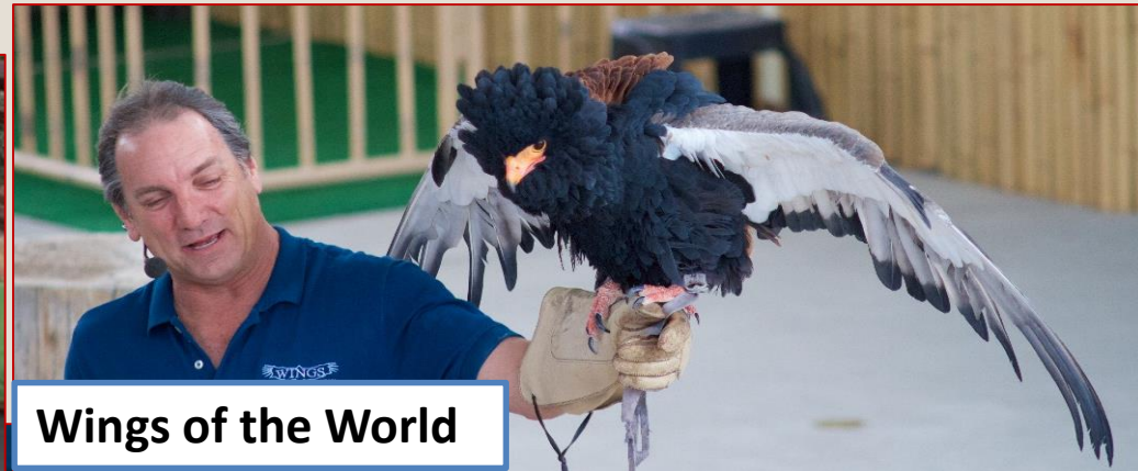
Wings of the World