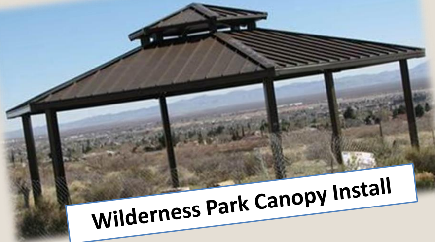
Wilderness Park Canopy Install