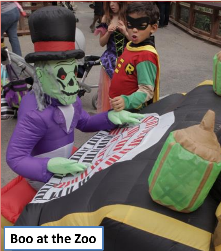
Boo at the Zoo