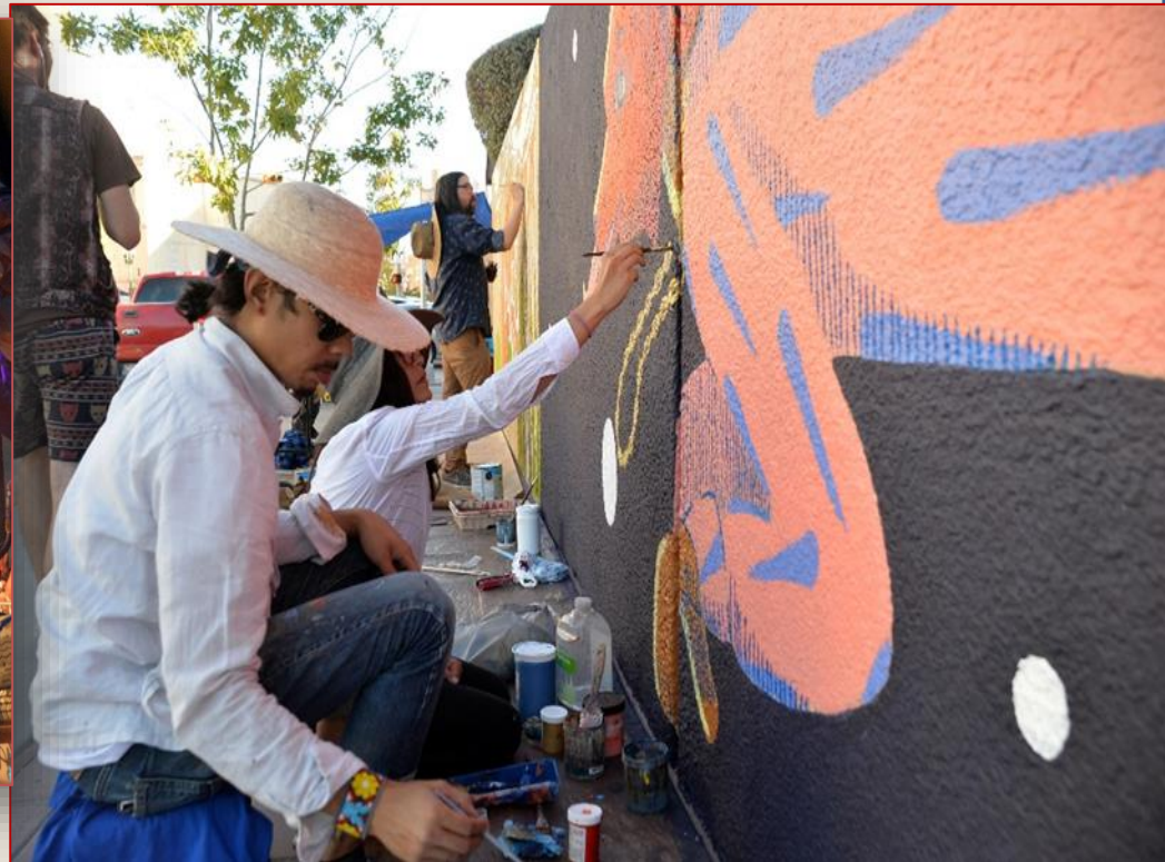
“Off the Wall” Mural Installation