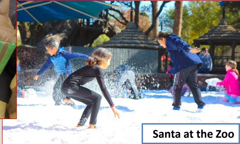
Santa at the Zoo